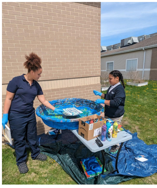
Check out some of the fantastic art from the Focus Learning Academy East student art show!